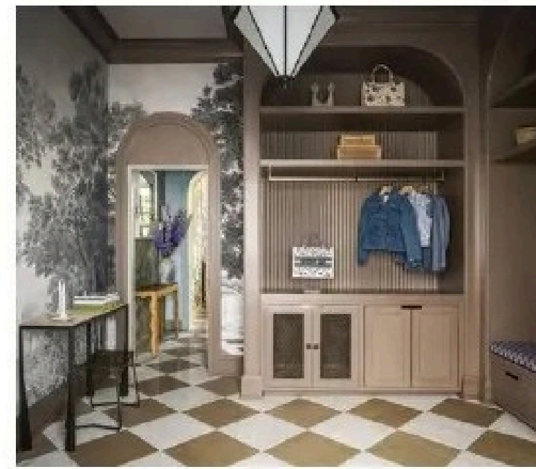
From left: Ablaze Design Group turned out a stunning kitchen; JenMarie Interiors created a mudroom that encourages lingering.

"I love showhouses mainly to see what designers create when they are their own client."