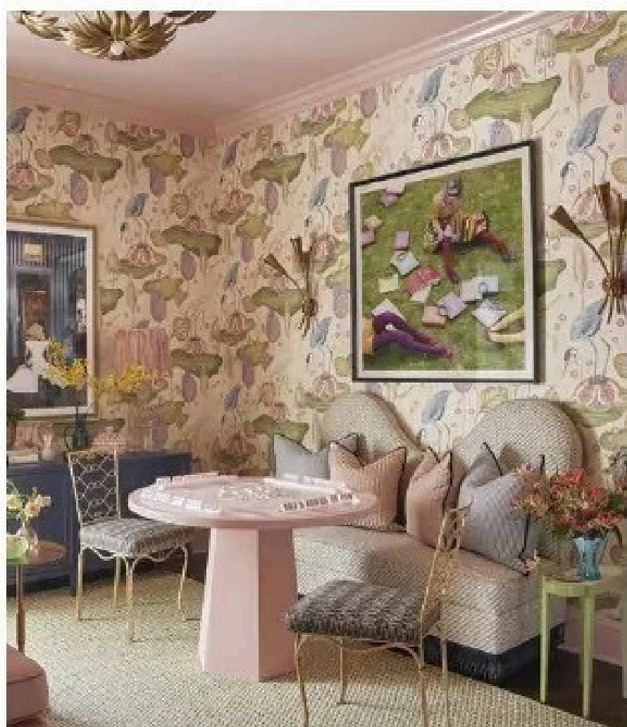
From left: White Couch Design's mahjong room is playful yet chic; the first floor hall and stairwall exude charm thanks to Lauren Collander Interiors.