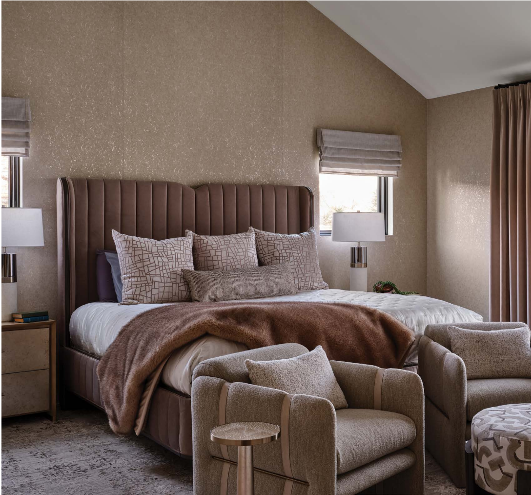
From top: The primary suite pairs a Continuum king bed and Cigar club chairs from Caracole against Pierre wallcovering by Holly Hunt in Limestone; set within a bookshelf layered with curated accessories, a “Memory of the West” framed print from Uttermost is joined by a Curata writing desk from Hooker Furniture and Bahati chairs from Arteriors in the home office.

and its connection to the adjacent scullery. The team ultimately eliminated visible doorways in favor of a more seamless architectural expression, allowing the kitchen to read as a continuous plane of cabinetry and stone. In the scullery, softer moments—including a pendant at the window and a concealed pantry door—balance function with beauty, while an unexpected pop of emerald green shelving adds a playful finish.